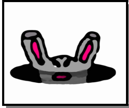
Bridget O'Bunny Can't Come Out Because Everyone Hates Her

Snitch bunnies cannot snitch well when they cannot hide. Bridget O'Bunny returned to her hole. Now she was known. In time, all the bunnies came to know about Bridget O'Bunny the snitch bunny. No one would trust her anymore. Bridget O'Bunny could never come out of her hole again, because nobunny likes snitch bunnies.