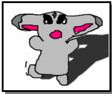
Bridget O'Bunny Pretended to Be Nice, But She Was Really A Snitch Bunny

While this was happening, Steve De Bunny was confused. "How do the wolves know where to find me? How do the wolves know how to predict what I will do? Why do the wolves say bad things about my special bunny and our beautiful baby bunny?" One day, Steve De Bunny saw Bridget O'Bunny in the shadows, watching. He secretly watched back. He saw Bridget O'Bunny talking with the wolves. He now knew what was happening to his beloved bunny family. His old friend, Bridget O'Bunny, was not a friend. She was a snitch bunny.